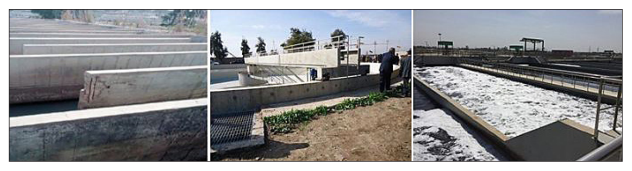
Figure 1. Ilustravive photos of Al-Muamirah treatment plant, Hilla city, Babylon governorate